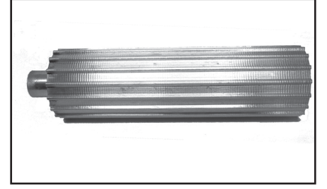
For AT10 pitch pulley stock, see page 369.